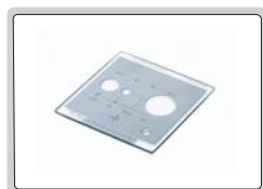
calibration plate (included)