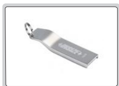
16G USB flash disk (included)